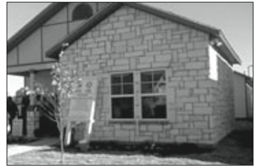
The Polk family new home

Food Pantry – The North Texas Food Bank welcomes you to your new home with a starter kit of pantry items when you move in. Congratulations.