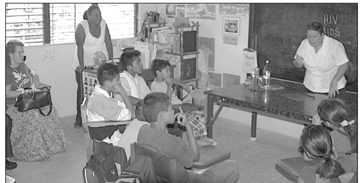
The hearing-impaired class at the Anglican school we visited